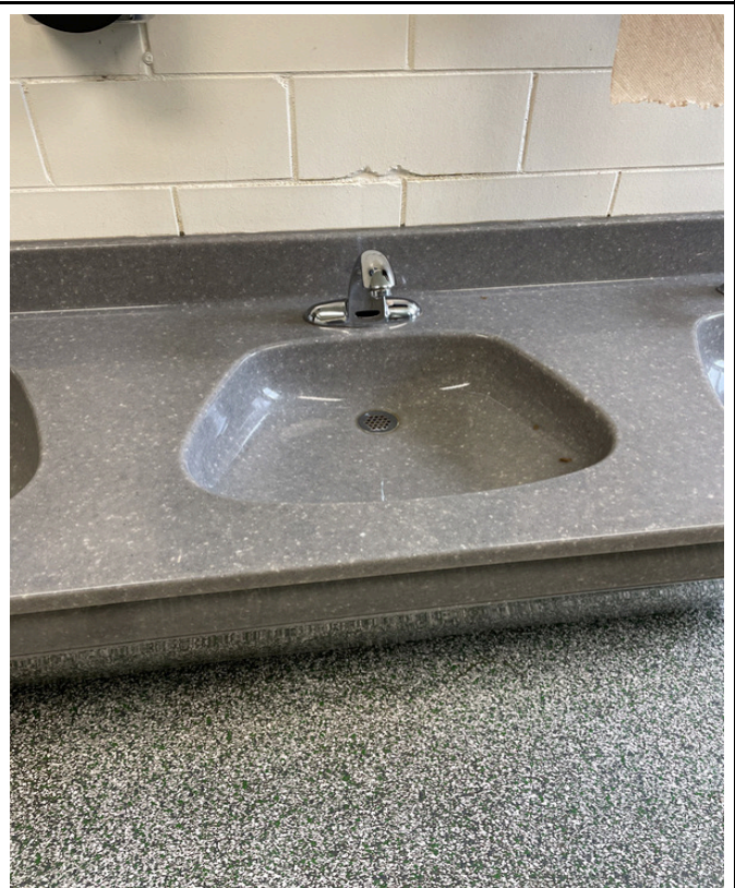
5/8/2024 - 527-17 - High School - Main Hallway Men's Restroom Center