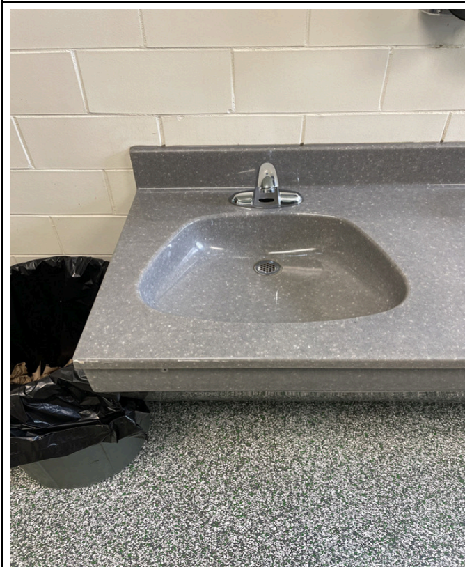
5/8/2024 - 527-16 - High School - Main Hallway Men's Restroom Left