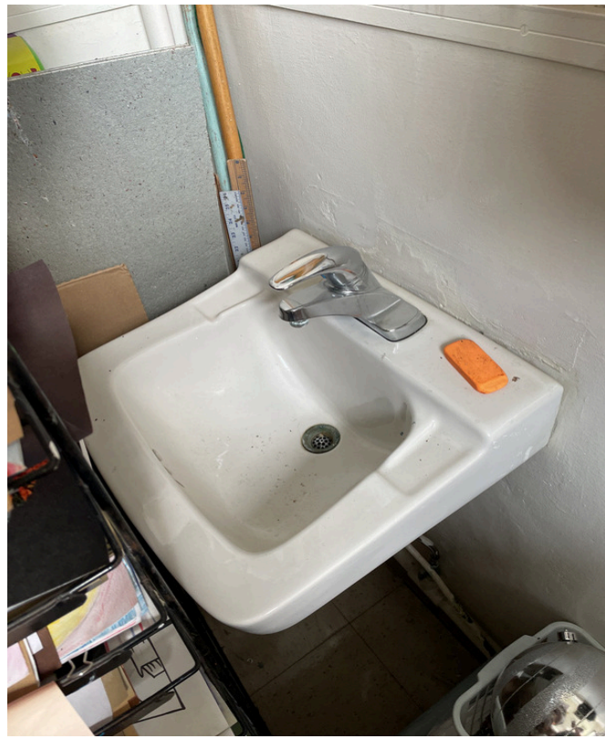
5/8/2024 - 527-3 - Specials (Art & FACS) - Room E100b