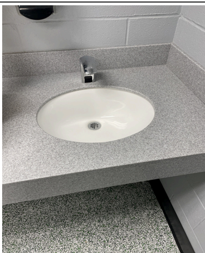
5/8/2024 - 527-6 - 5th/6th Grade - Men's Restroom Right