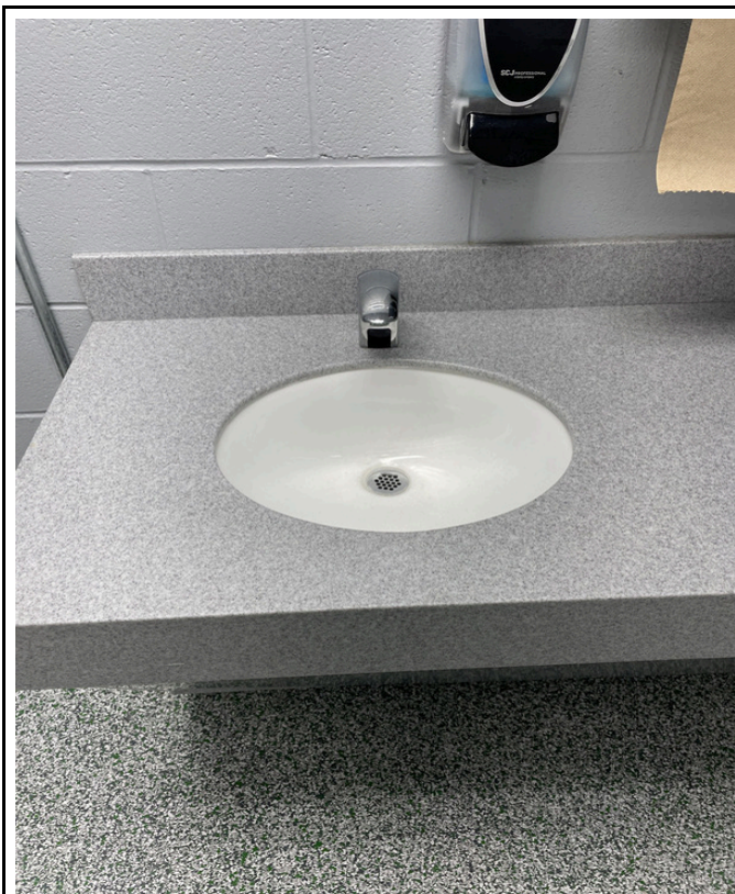
5/8/2024 - 527-5 - 5th/6th Grade - Men's Restroom Left